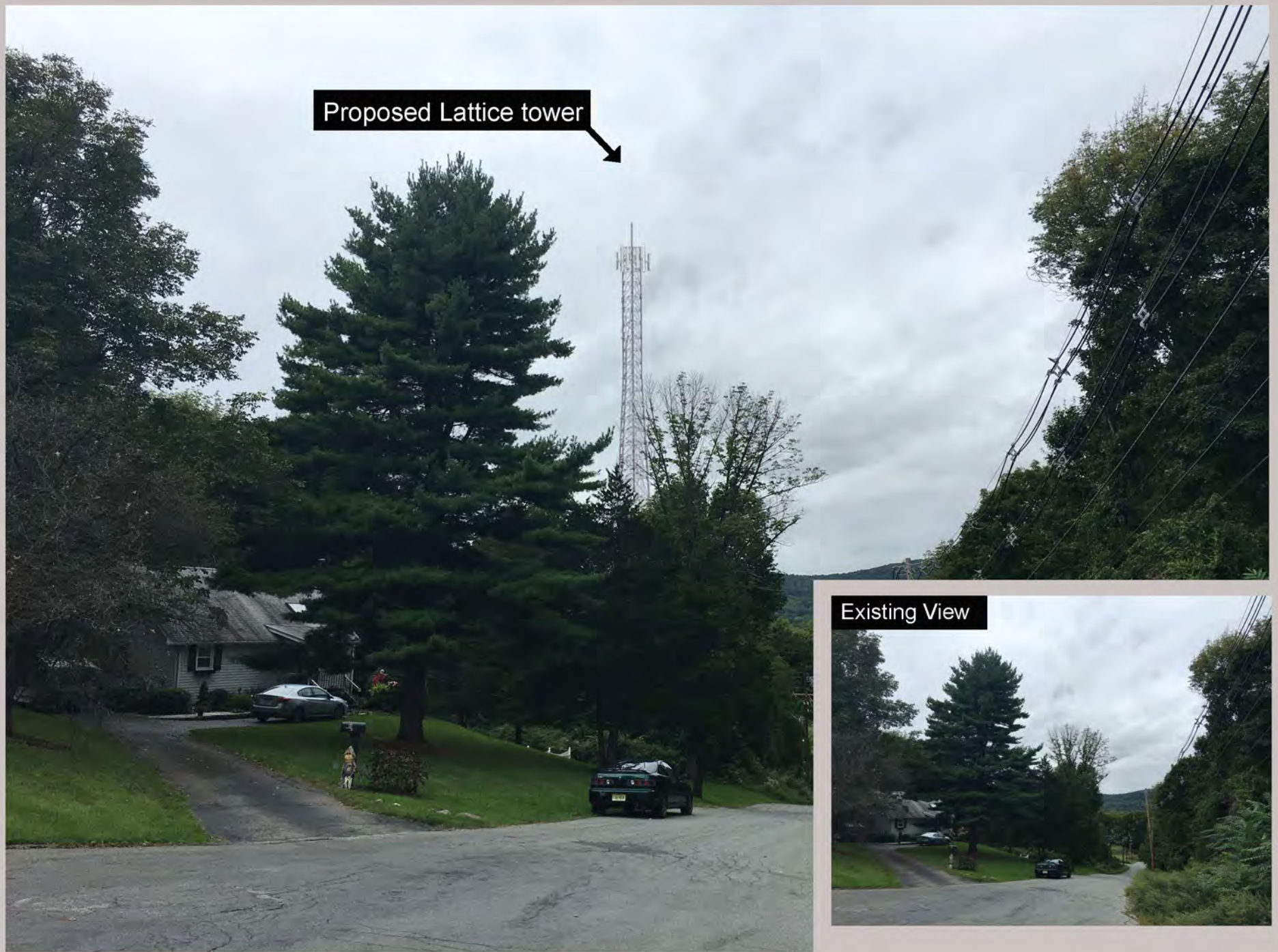
Simulated view from location #1 approximately 350 feet southeast of the site.