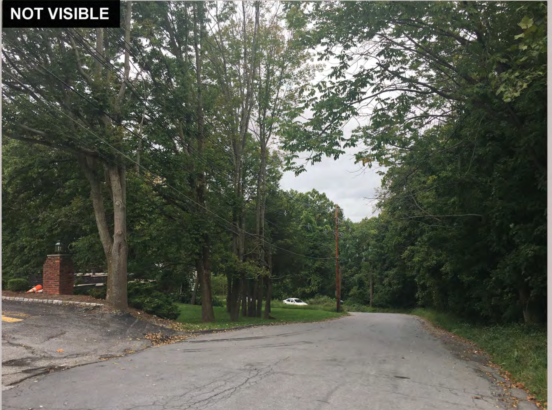
View from location #5 approximately 880 feet southeast of the site.