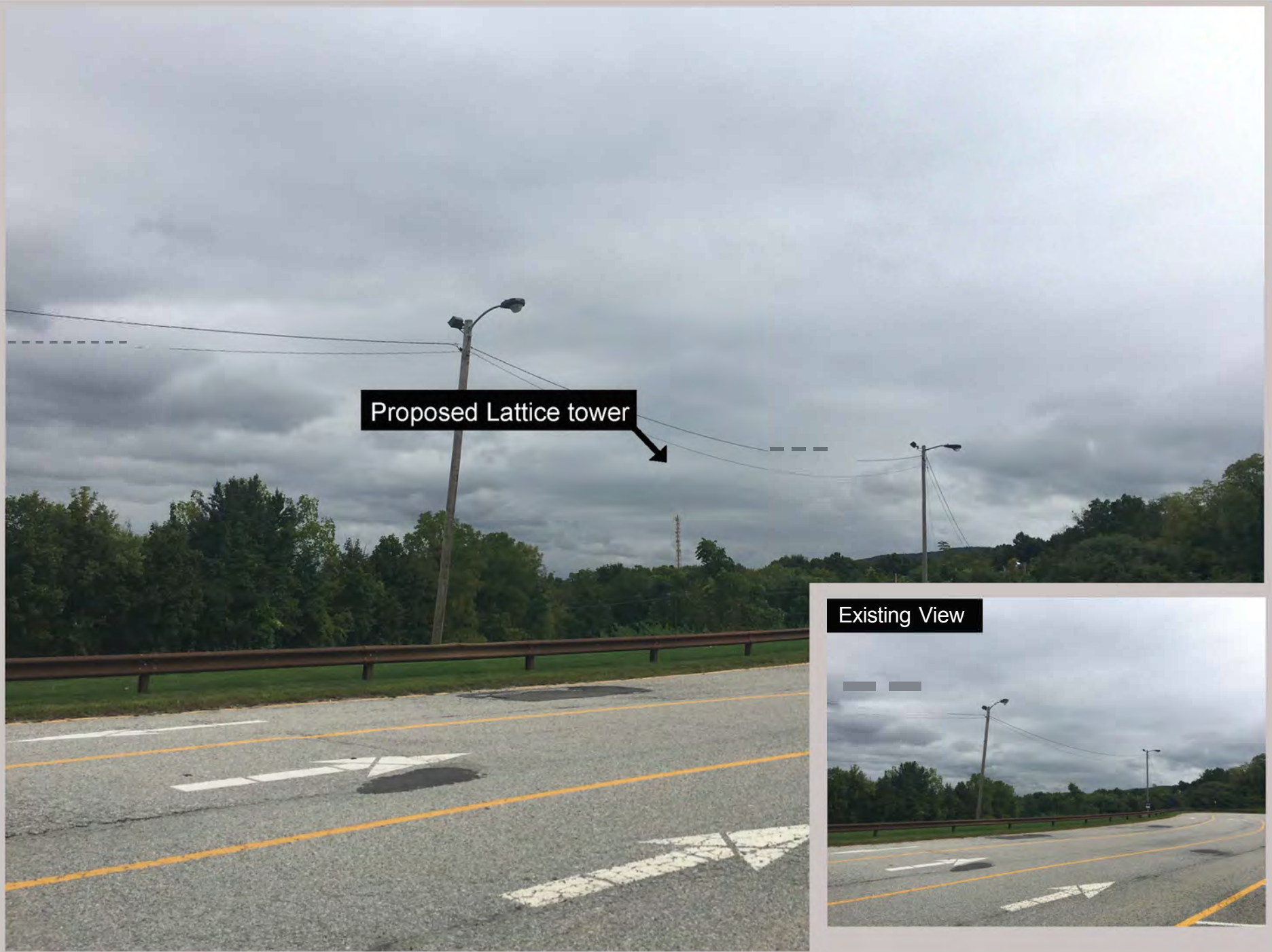
Simulated view from location #6 approximately 1,280 feet southwest of the site.