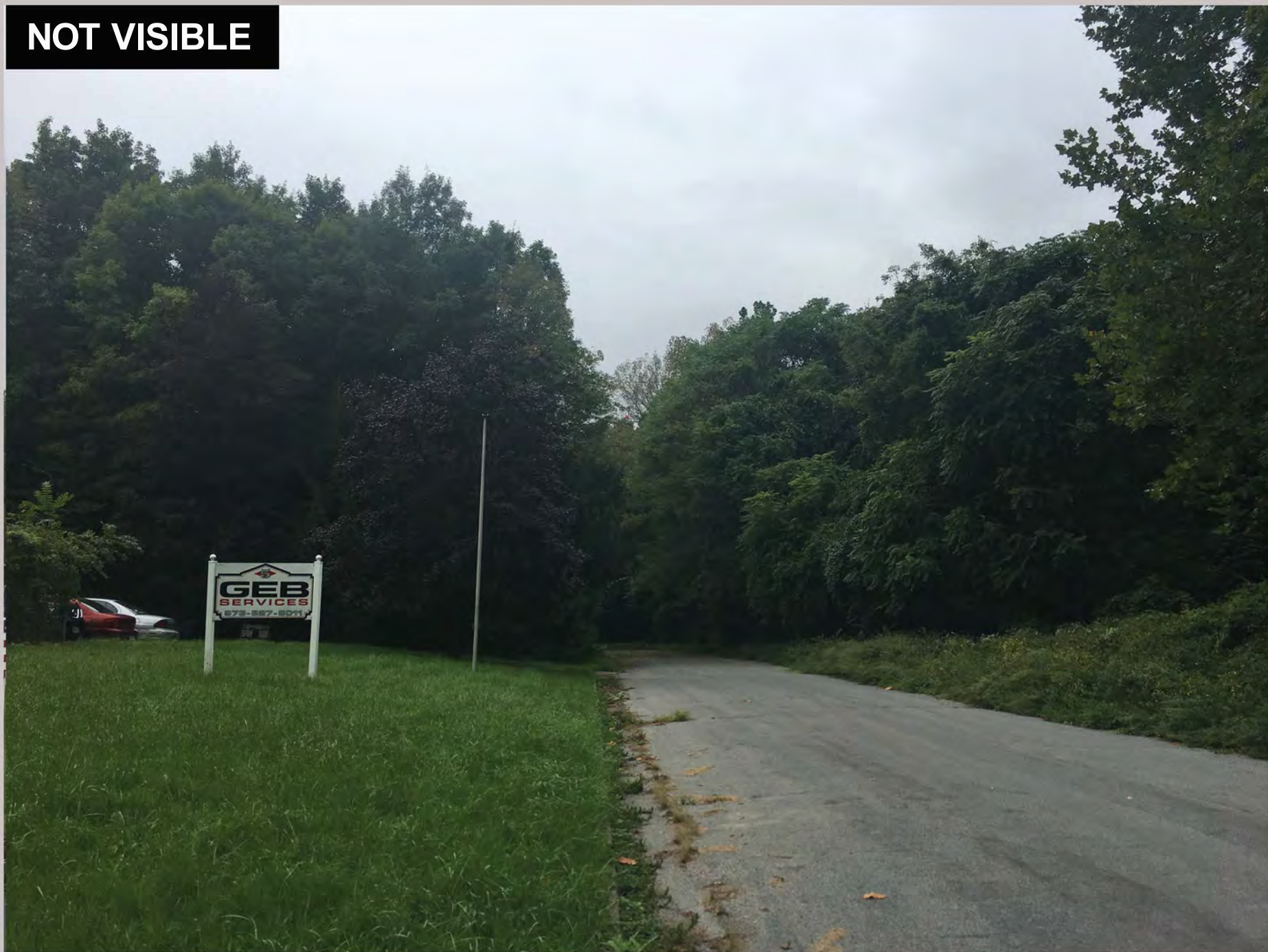
View from location #3 approximately 840 feet northeast of the site.