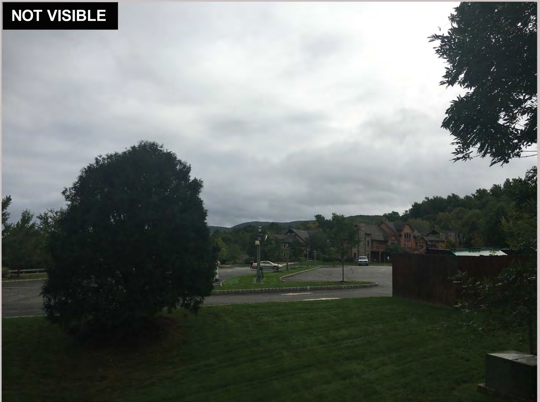
View from location #8 approximately 2,700 feet west of the site.