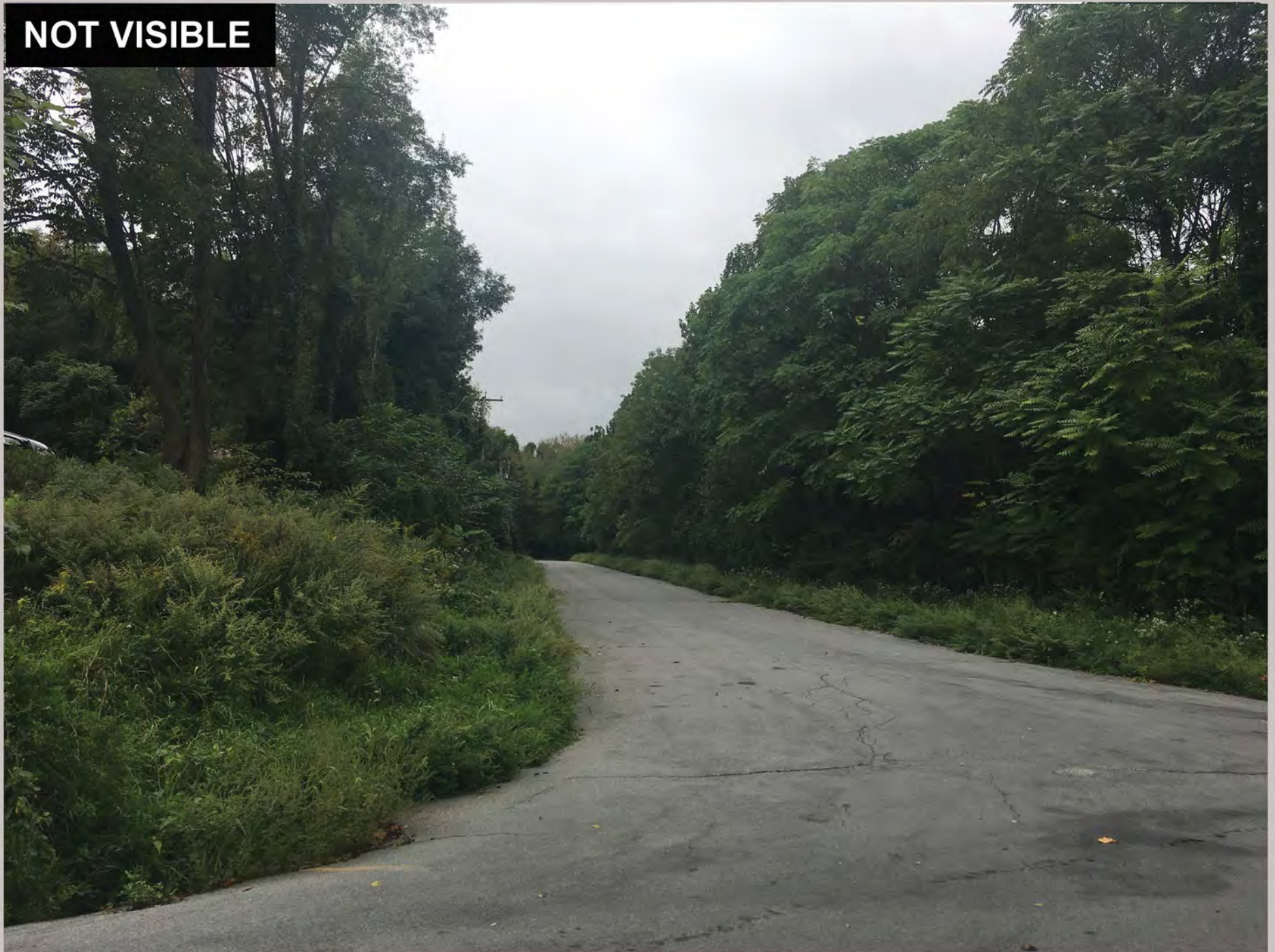
View from location #2 approximately 1,290 feet northeast of the site.