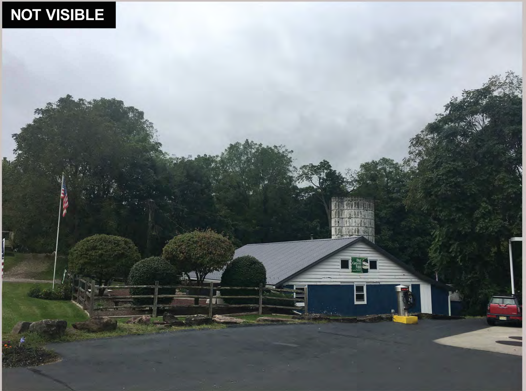
View from location #4 approximately 1,450 feet east of the site.