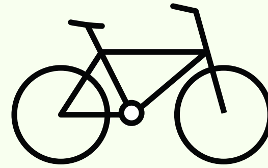
HIKE, BIKE & KITE DAY