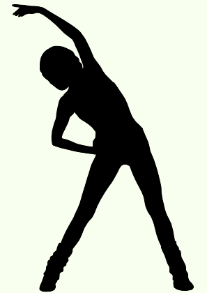
SUMMER FITNESS PROGRAM