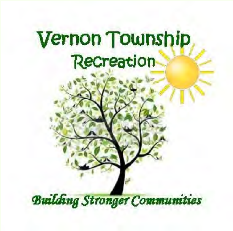
RECREATION & COMMUNITY AFFAIRS