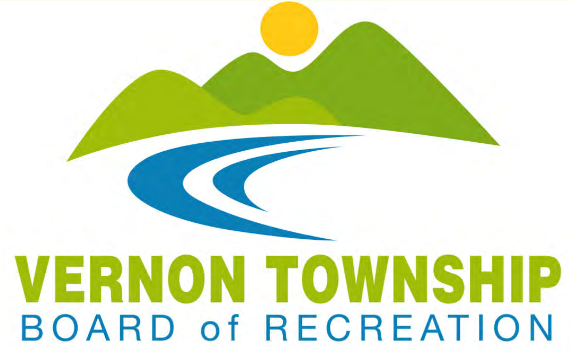
BOARD OF RECREATION